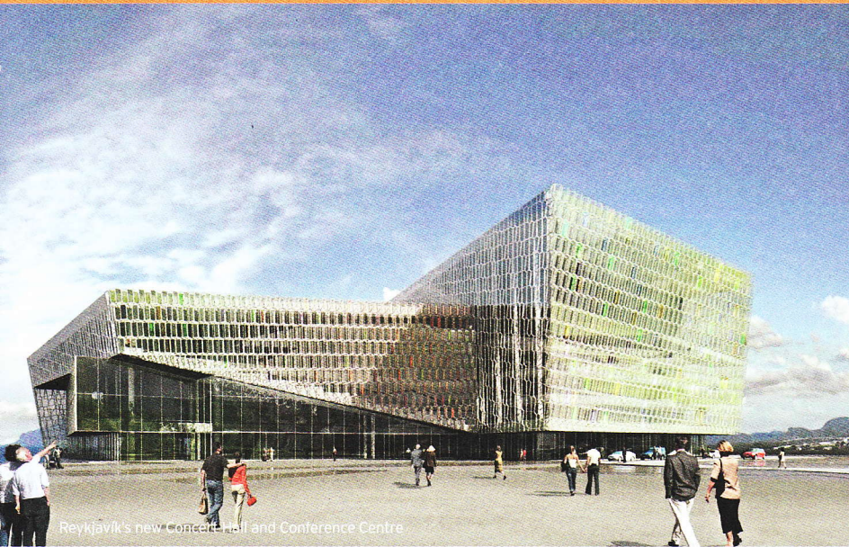
Reykjavik's new Concert Hall and Conference Centre